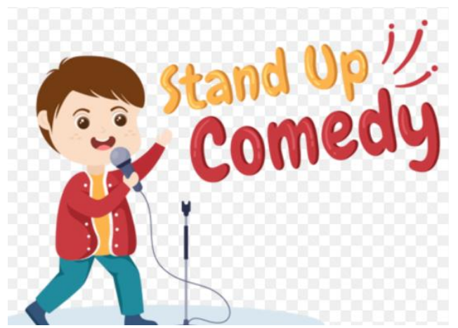
Annual "Stand Up For The Blue" Comedy Show Fundraiser March 22, 2025