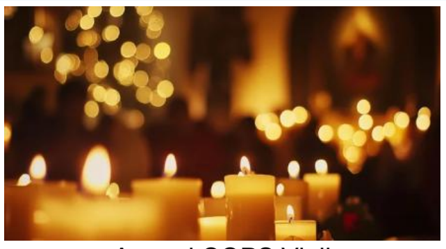
Annual COPS Vigil December 3, 2024 7:00 PM Browncroft Community Church 2530 Browncroft Road